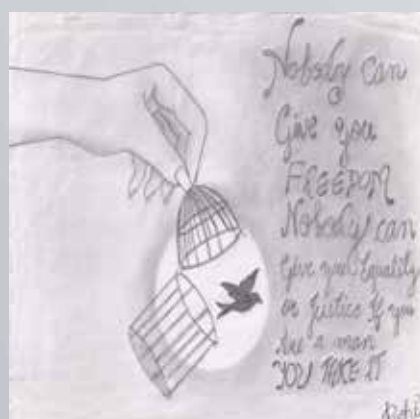
Ruchi IX A