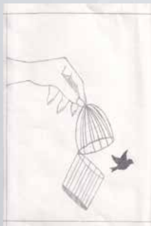
Kirthi IX A